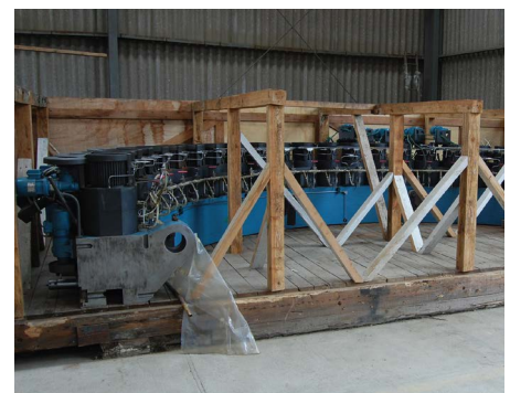
Insufficient preservation of the machine parts in a wooden box without dry air preservation