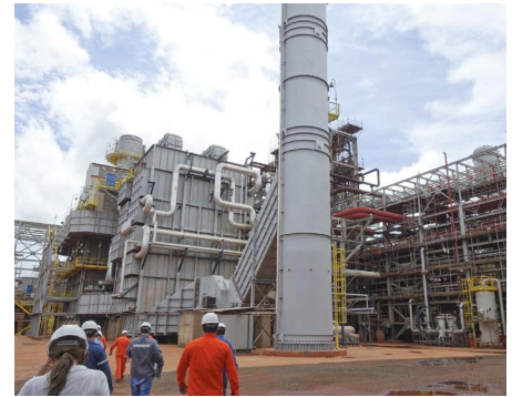
Fertilizer plant in Brazil

In general during transport and erection, preservation measures of components are necessary. Furthermore, delays in construction or commissioning of nuclear power plants, combined cycle power plants, solar thermal power plants, refineries or other fabrication facilities leads to an increased risk for sensitive components due to corrosion or contamination. Therefore, it is important to preserve and store the sensitive and expensive components with adequate measures.