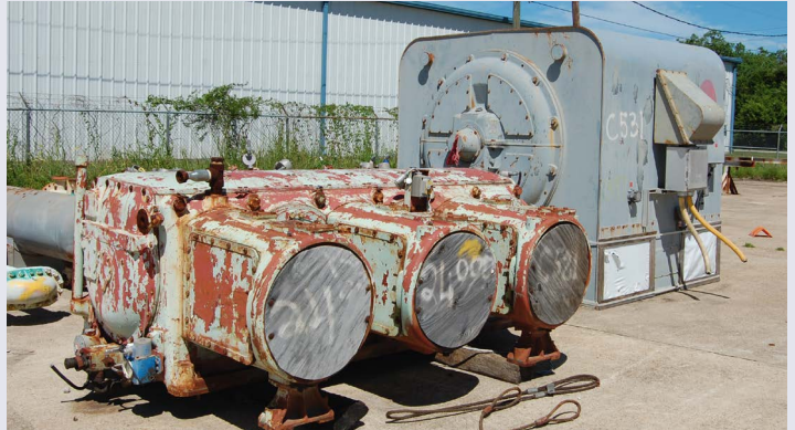
Corrosion due to storage of a compressor in an open air area without sufficient protection