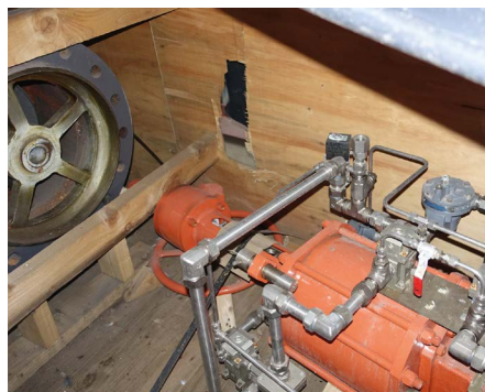
Insufficient and faulty preservation measures