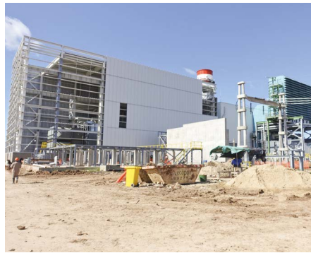
Combined cycle power station in Argentina