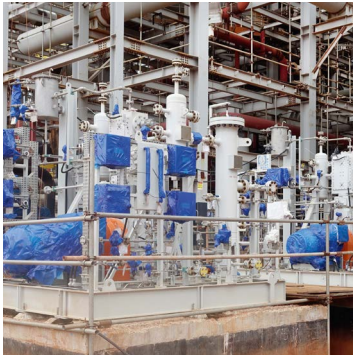
Preservation measures in a refinery